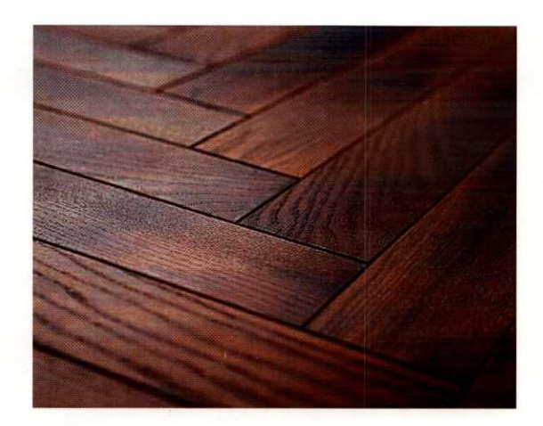
Thermo-Treated Ash Flooring

Available as domestically harvested poplar or ash, this product provides up to a Class 1 exterior durability rating depending on species. You can expect years of service with minimal maintenance from this sustainable alternative to tropical imports such as teak and ipe.